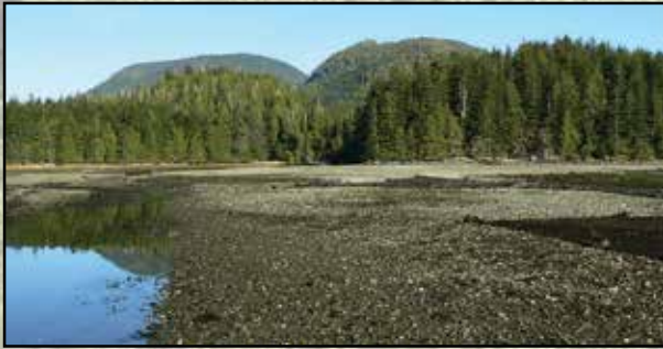
Nootka Sound Shellfish Tenure: 13.5 acre shellfish farm in Kendrick Inlet. Very productive manila clam beach with small section of oyster culture. Standing crop on the ground, seven years left on lease. Excellent location adjacent to Crown land, lease in good standing. West coast Vancouver Island. $160,000