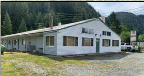
Zeballos Motel: 14 room motel with commercial kitchen, restaurant space, one bedroom owner/manager's suite and management office. Guest rooms each have a 3 piece bathroom and come furnished with two beds, microwave and mini-fridge. Lots of possibilities – fishing catering lodge; work crew accommodations; rentals. West coast Vancouver Island. $595,000