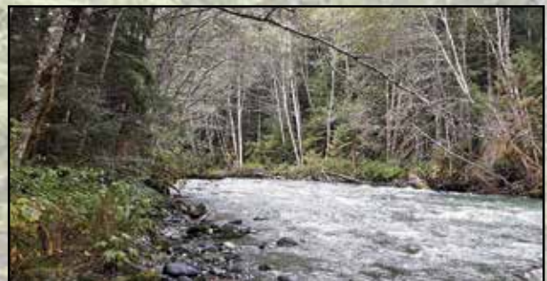
DL1101 & 1106 Salloomt River: Bella Cooola region. Heavily timbered 313 acres in two adjacent titles that straddle the scenic Salloomt River for 1.6 km, a substantial freshwater system that includes a spectacular canyon. Good road access via Forest Service Road. Timber cruise summary from 2020 available – net volume 41,550 cubic metres. $1,200,000