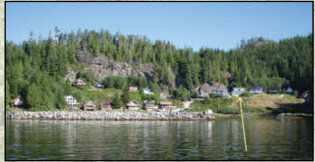
West Coast Vancouver Island: 1920 sqft residence in Haggard Cove, part of a water access coastal community at the entrance to Alberni Inlet, Barkley Sound, Broken Islands Group and the open Pacific. Community has a substantial marina in a protected location. The home, which overlooks the marina, is a great layout for a large family/group. $490,000