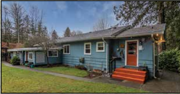
Lake Cowichan Riverfront Home: Classic older home on the banks of the beautiful Cowichan River, nicely updated, with lots of living space including split level living room overlooking the river. Upgrades include new windows, newer roof, redone main bathroom, new heat pump. Property is fenced, nicely landscaped with mature rhododendrons and fruit trees. Listed at appraised value! $1,100,000

Great Choices for Recreational Use & Year-round Living • bcoceanfront.com • Great Choices for Recreational Use & Year-round Living • bcoceanfront.com