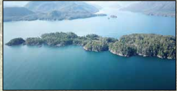
Private Island Gem: Centre Island, in Esperanza Inlet. 110 acres with over 15,000ft of oceanfront with two significant and protected bays. Fully treed. Two large ponds hold year-round water. One-room cabin plus workshop as well as a complement of material and equipment. Protected location with quick access to the open Pacific! West coast Vancouver Island. $1,890,000